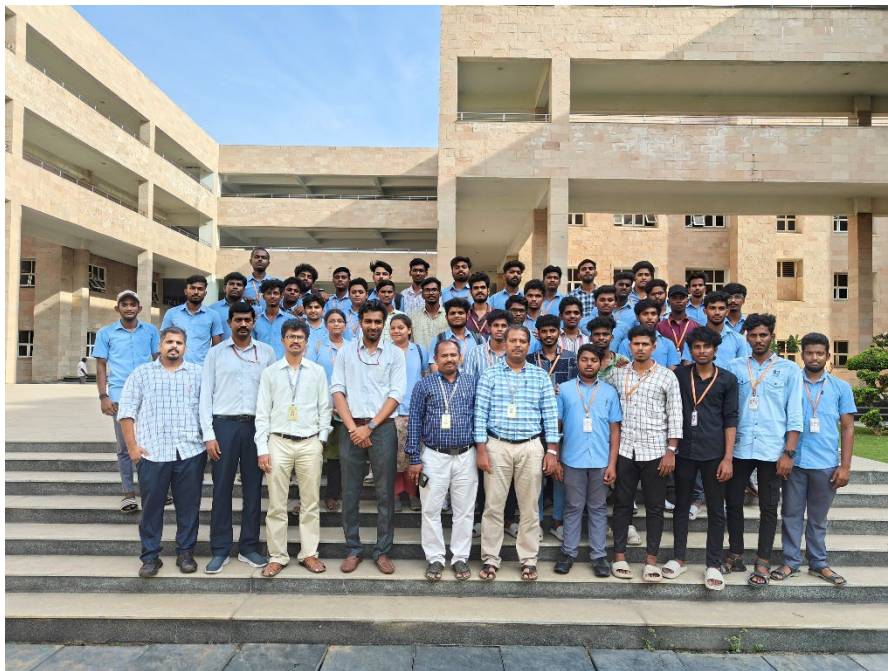
Faculty team of PSG iTech and PNSA College along with the student participants